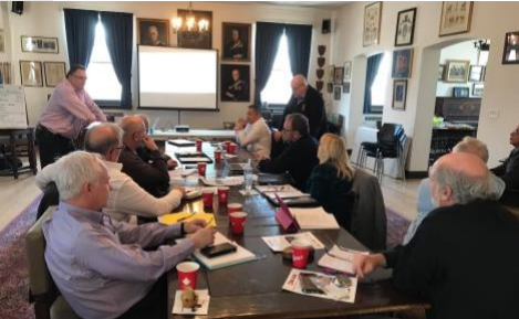
Facilitator training Winter 2020

The winter of 2020 focused on preparing for the Spring Respect Forum meetings. The training of facilitators, the launch of invitations to the Respect Forum, the creation of program evaluation tools and the implementation of the development plans of the various Outreach activities formed the focus.