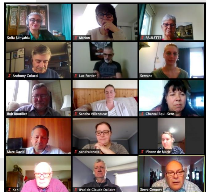
Respect Forum – Montreal, QC Spring 2020

In June 2020, the Respect Forum team ran a pilot project to test various approaches to service mapping for served communities. Based on an innovative methodology, our facilitators conducted four working meetings with representatives of organizations supporting veterans, firefighters, police officers and paramedics. This project will be developed at the national level for implementation during next fall's meetings.